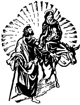
St. Luke — Chapters I and II

And the angel Gabriel was sent from God unto a city of Galilee, named Nazareth, to a virgin espoused to a man whose name was Joseph, of the house of David, and the virgin's name was Mary