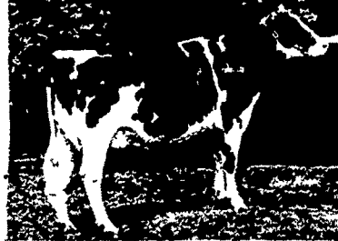
DAUGHTER OF 1883 "R MAPLE" KEN-RAY CITATION RUBY, EX