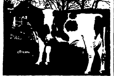
DAUGHTER OF 1900 "JO JO" CLINTON CAMP JOJO BERYL, EX

Grand Champion 1970 Colorado Black & White Show 2y 2m 365d 2x 21,265M 3.7% 781BF 3y 8m 365d 2x 24,298M 3.2% 785BF