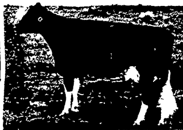
DAUGHTER OF 1881 "BOOTMAKER" PACLAMAR TRIUNE SENATORA, EX (93)