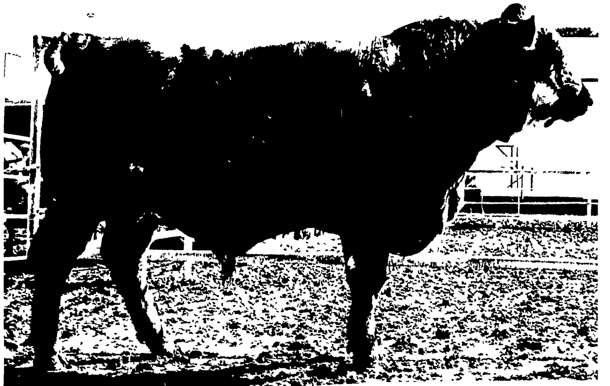
Big Red, a Simmental, Brown Swiss, Angus cross, claims a new world yearling weight record. The bull managed to pack on a hefty 1,705 pounds in 365 days.

Big Red entered the Bull Station weighing 870 pounds for testing. After 140 days on test he weighed 1,535 pounds with approximately 25 pounds of feed