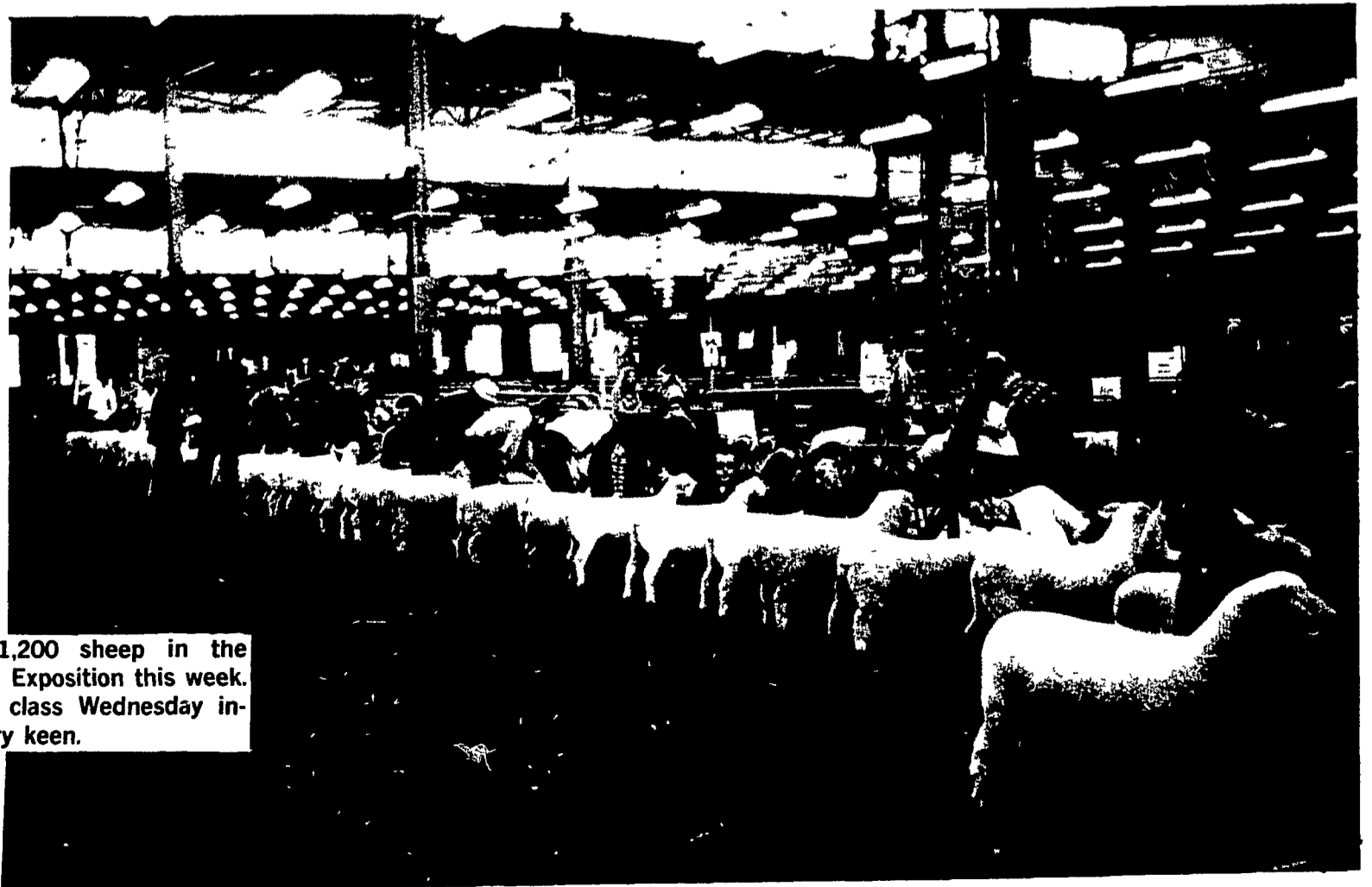
There were approximately 1,200 sheep in the Keystone International Livestock Exposition this week. As this Dorset fall-born lambs class Wednesday indicates, the competition was very keen.