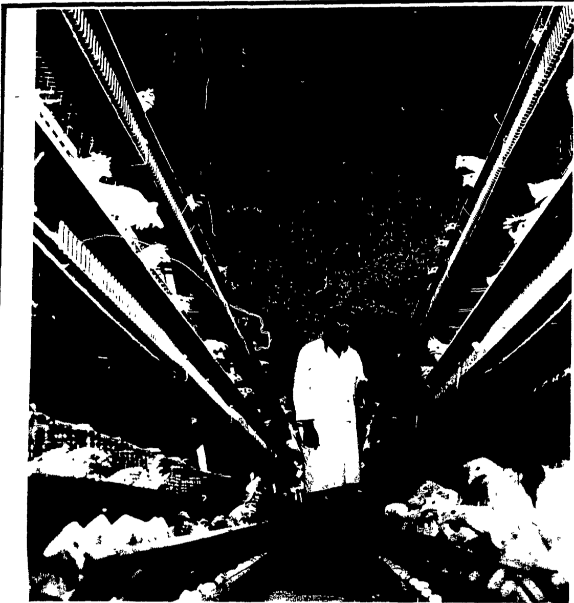
TRI-DECK IS THE MULTIPLE TIER CAGE SYSTEM WITH PROVEN PRODUCTION FEATURES

Three hundred agribusiness executives attended the statewide meeting.