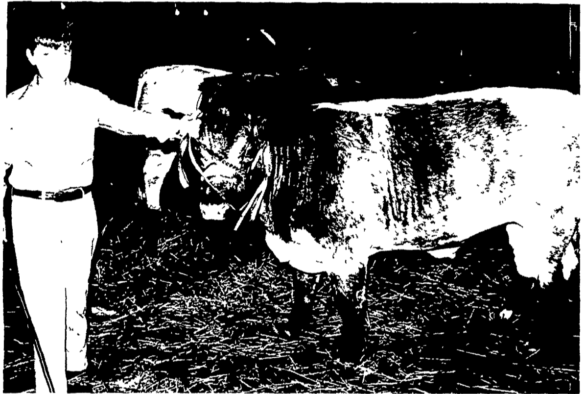
Robert Hess shows the grand championship form of his crossbred at the Lampeter Fair Wednesday night. The show judge said the animal was an easy first over some other good steers. The animal is wide in front and

rear, trim with straight lines, very long body and very straight back line which carries through to the head — almost the ideal beef animal, according to the judge and many veteran cattlemen attending the show.