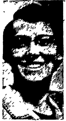
By Ida Risser

My children enjoyed the story of the folded arms of children in prayer being the inspiration for the shape of the pretzel. Watching a machine twist 50 pretzels per minute intrigued us and showed the significance of machinery in modern production methods.