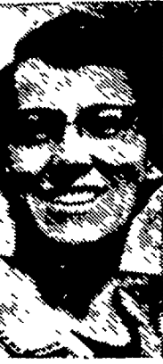
By Ida Risser

Then, I see a huge crane winging slowly overhead making an odd sound and the early morning trip is worthwhile.