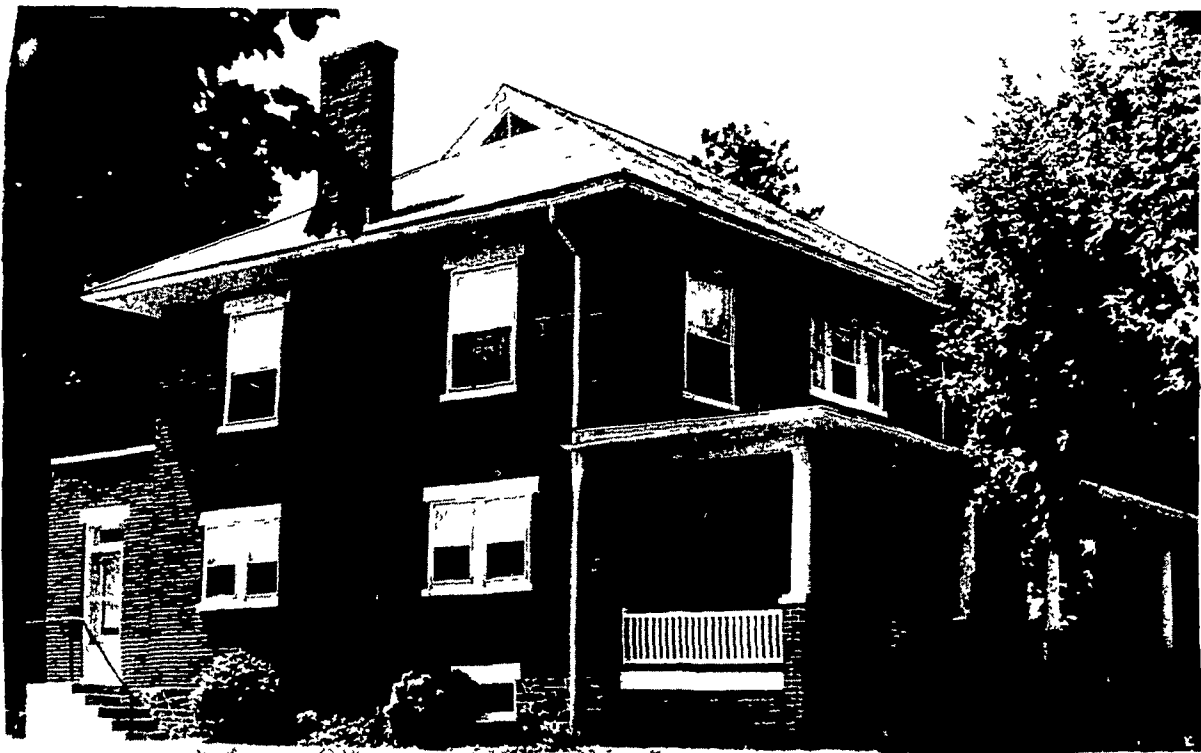
This is 1 East Fourth Street, Quarryville, the new health center building before renovations began this week. The building has

been a parsonage. The front porch will be enclosed for office space, including a reception room.