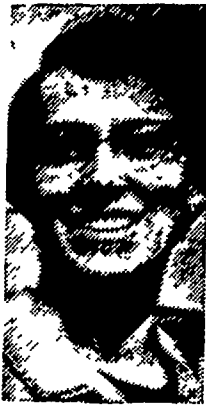
By Ida Risser

There are times when we approve of new super highways and there are times when they break our hearts