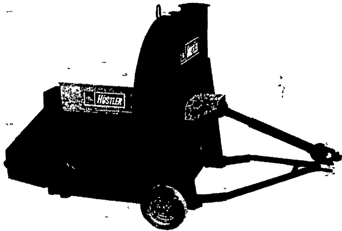
Curved Fan Blades Adjustable Shear Bar