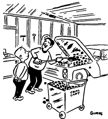
"This is one of the earlier models."