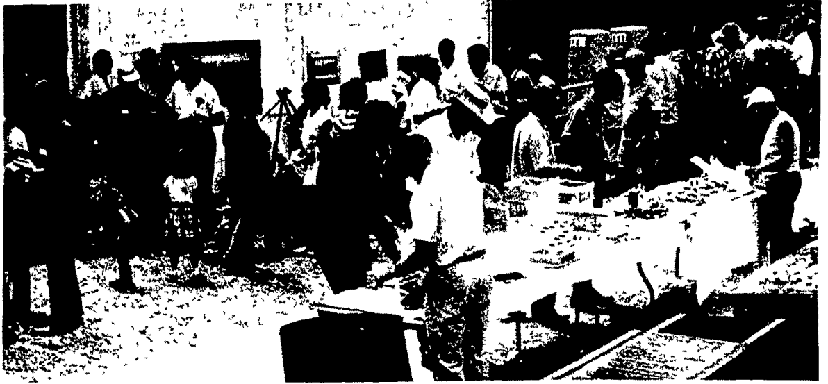
The chow line at the Angus Field Day was long for most of the noon lunch period. Here, things have quieted down a bit as the