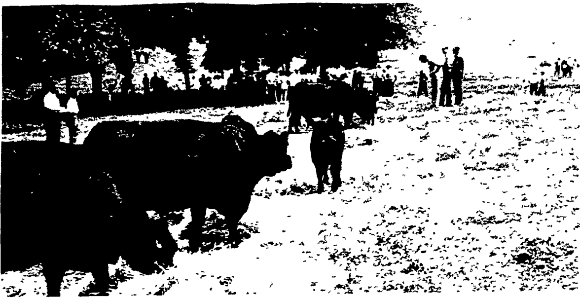
Crowd gathers in the Twin Oaks field to hear the farm's operation discussed. In the foreground cattle munch on hay as the last of

the contestants in the judging competition complete their score cards.