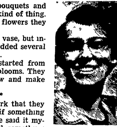
By Ida Risser

This summer, my son is working in a camp in Connecticut. Apparently, it is a rather exclusive Work Camp as the price is $1,200 — for eight weeks. It is staffed by 300 college seniors and college professors who teach music, art and crafts.