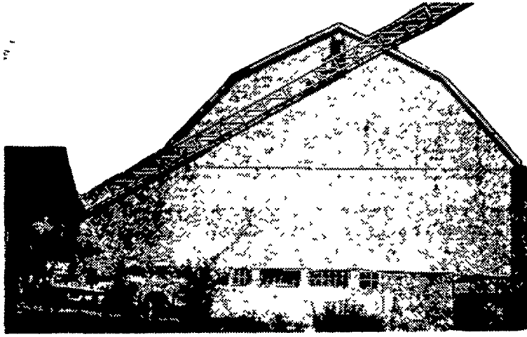
Aerial Ladder Equipment Used To Paint Your Farm Buildings

WE USE BRUNING QUALITY PAINT AND IT DOES STAY ON!!!