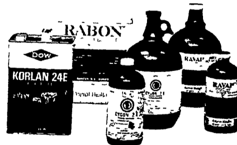
RESIDUALS—SPRAY ON WALL