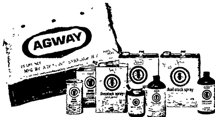
DIRECT ANIMAL APPLICATION