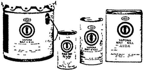
BAITS—SPRINKLE ON FLOOR AND WINDOW SILLS

The best time to start fly control is at the beginning