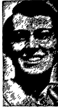
By Ida Risser

One time my big boy made six pies and forgot to put a crust under them until just before he put them in the oven — what a mess. He is often teased about that.