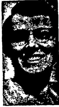
By Ida Risser

As we've just put up a big silo, I had to get in it and try it out for echoes. Now I too know what it feels like to get the last pickle in a jar.