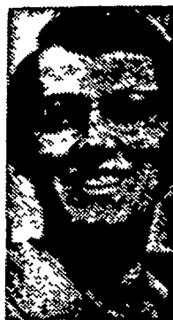
By Ida Risser

Apparently, it was used to dispense medicine and broth to the