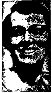
By Ida Risser

It is a real pleasure to watch a tree grow. Put one in your front yard or back yard or even along your lane.