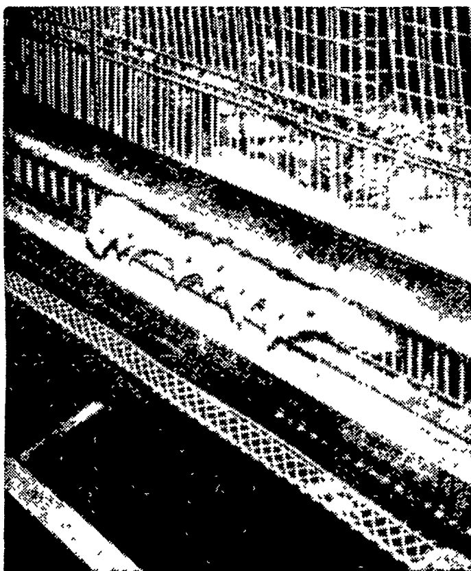
Hinged bottom model Chik-Eze includes egg tray which can be put into use at 10 weeks.

This feature will actually permit birds to be kept in the start/grow cage at full laying age if necessary. It also eliminates problems of egg gathering and egg breakage if circumstances delay movement of pullets to grow/lay or permanent lay cages, and it takes care of eggs from birds that lay prematurely. The lowered floor provides a 2 inch gap for eggs to roll out onto tray.