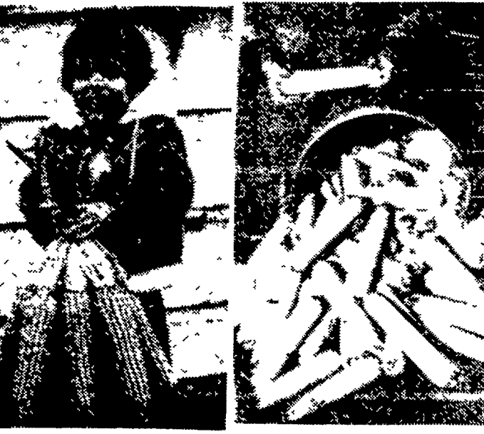
Muncy Chief SX777