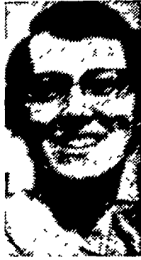
By Ida Risser

Generally, I think of farm women as being an ingenious lot. There are so many times when they must improvise. When you don't live next door to a store, you make substitutions in cooking and in repair work and all lines.