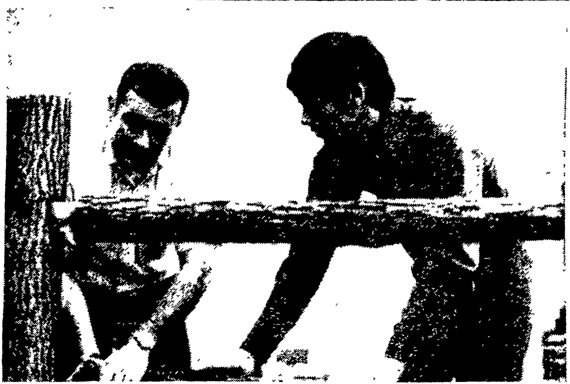
Putting a rail in a wood fence which the FFA students built at Brownstown