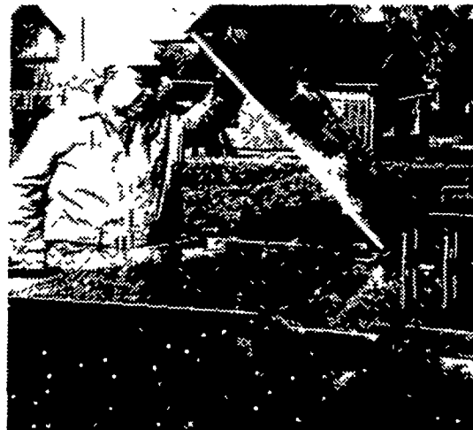
Titus Burkholder checking one of the many (used) bulk milk tanks we buy and sell.