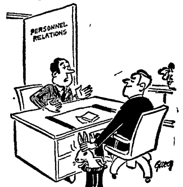
"Somehow the magic has gone out of our relationship