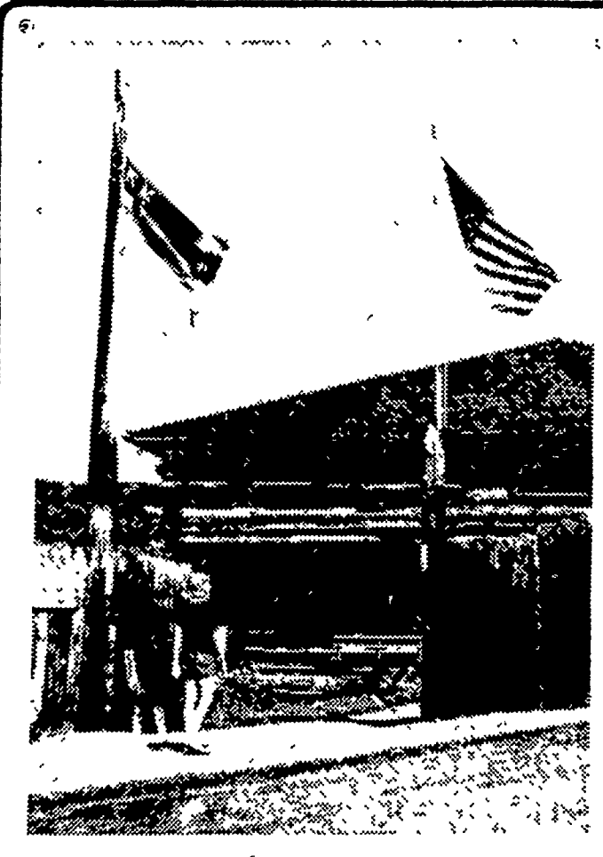
One of a series sponsored by the Pennsylvania Newspaper Publishers Association and presented as a public service as