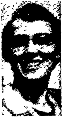
By Ida Risser

When we put in a bulk tank we had no problem disposing of our milk cans. Many people con-