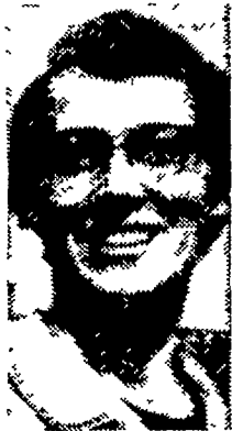
By Ida Risser

For a little papoose, tuck his scampering feet into these mocasin slippers. Each slipper is made up of four crocheted motifs, done with knitting worsted cotton yarn. The sizing is for children's feet in small, medium and large (7-9 inch sole lengths). Free instructions are available by sending a self-addressed, stamped envelope to this newspaper along with your request for Leaflet PC 4185.