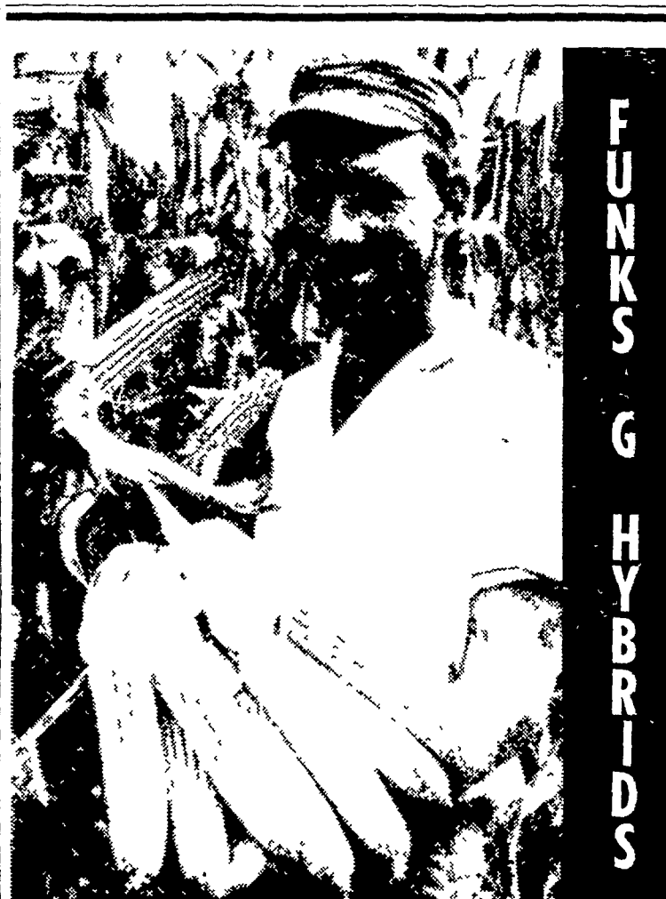
The "stand-out" corn crops in Lancaster County in 1970 were the crops grown from Funk's-G seed. For grain . . . for silage . . . plant the "hot" hybrids . . . the most talked about hybrids . . . Funk's-G! Call your Hoffman Seed Man.

McKetta particularly blamed the crime problem on improper guidance of children by their parents and failure to instill a proper respect for individual rights.