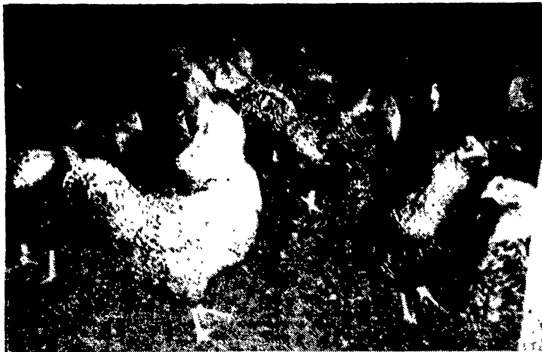
A house of capons on the Miller farm ready for the Thanksgiving market.