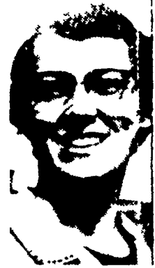
By Ida Risser

The wind blows through the deep piles of dark brown oak leaves and the fat grey squirrels dart up the opposite side of the bare trees as I walk in the woods. The quiet is broken only by large airplanes droning overhead and an occasional nuthatch. November has arrived.