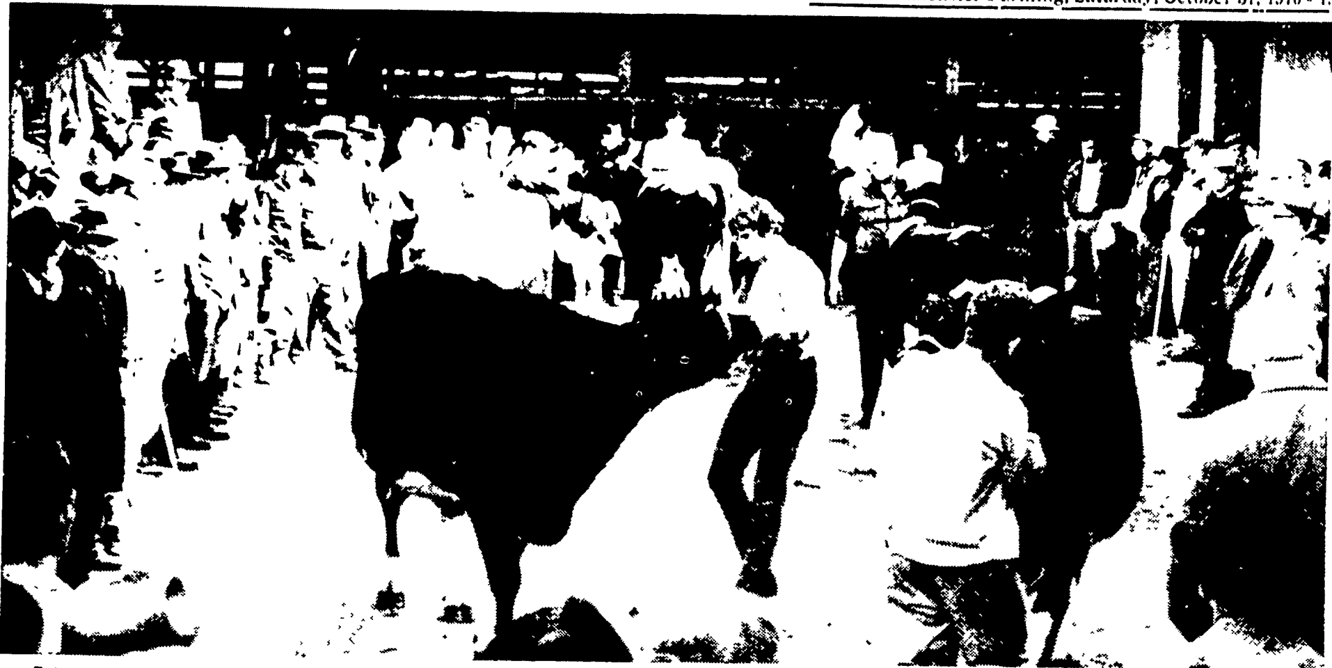
Interested farmers and prospective buyers gather round at the New Holland Sales Stables Wednesday for a good look as the Show

nears completion. The judge had already narrowed the field to a few of the best animals.