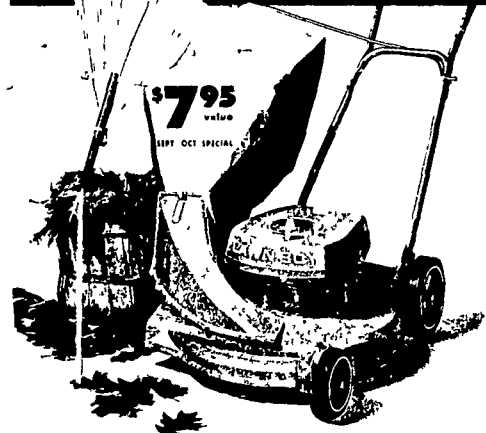
COME IN! SEE THE NEW 1971 LAWN-BOY MOWERS TODAY.