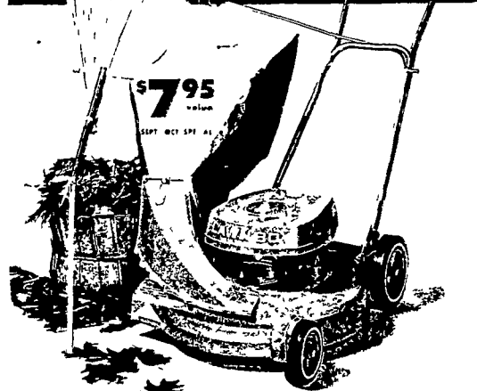
COME IN! SEE THE NEW 1971 LAWN-BOY MOWERS TODAY.