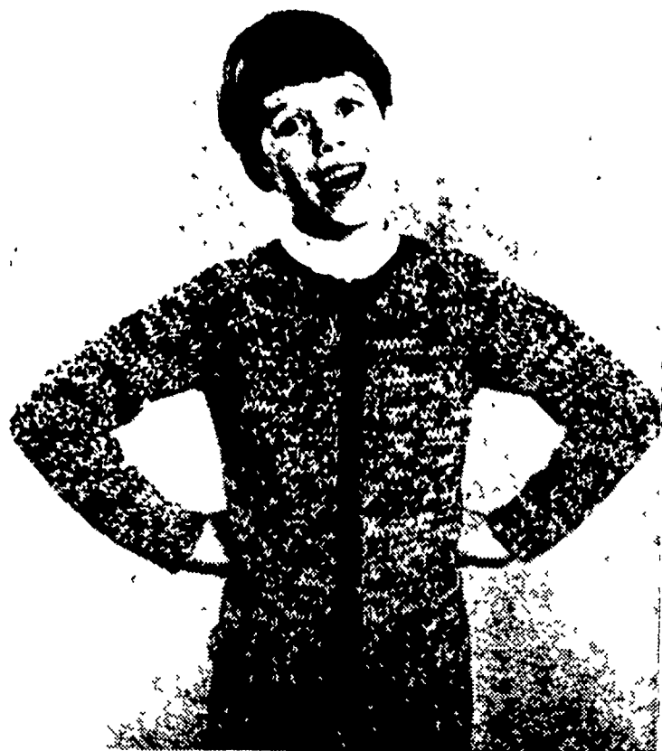
Tweed is a great kick for kids to be on. A raglan-sleeve cardigan has neat styling for school, plus a rough-and-ready texture for after. The zippered front makes the sweater suitable for boys or girls, in children's sizes 4-10. It is knitted in the stockinette stitch, mixing strands of white and navy fingering yarn together. The neck and front edges have a simple crocheted border. Free instructions are available by sending a self-addressed, stamped envelope to this newspaper along with your request for Leaflet PK 1117.

With ants, the key to control is to find their nest and apply insecticides on and into it and anywhere ants travel. The intent is not only to kill the ants you see but also to get worker ants to carry poison to the queen in the nest as they feed her, thus killing the mother of the colony and destroying the source of population increase.