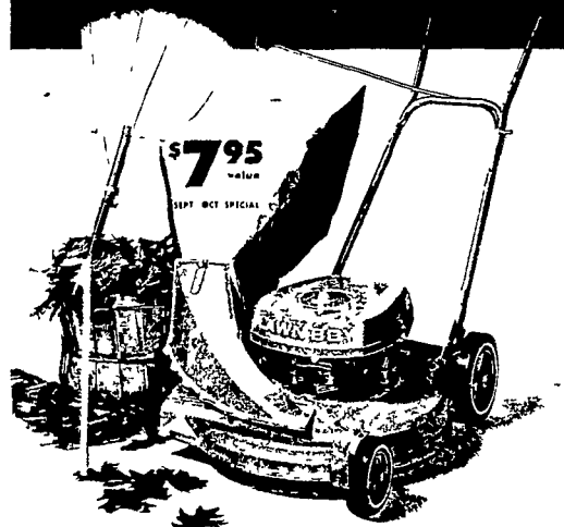
COME IN! SEE THE NEW 1971 LAWN-BOY MOWERS TODAY.