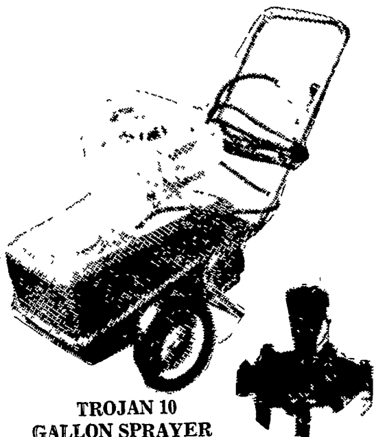
TROJAN 10 GALLON SPRAYER

SEE THE JOHN BEAN ALL PURPOSE PORTABLE SPRAYERS