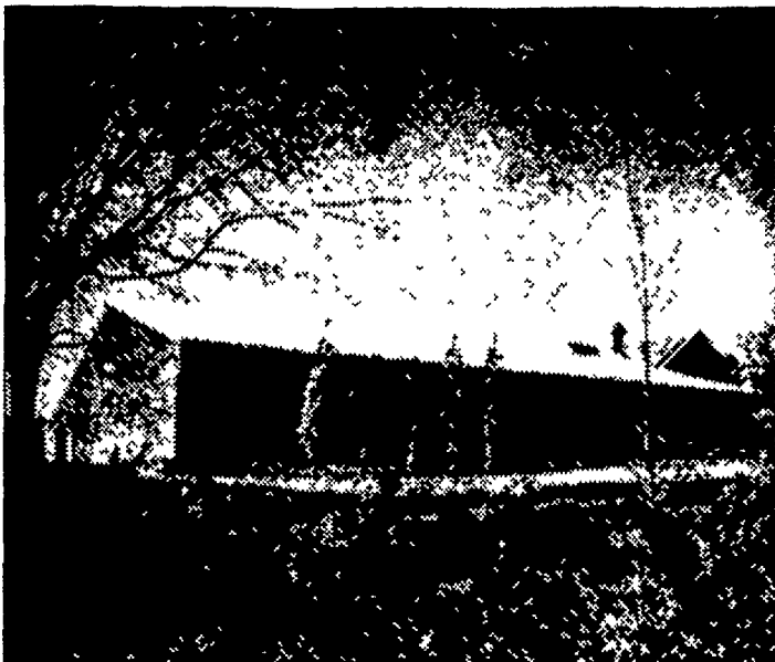
Not all Agway buildings are designed for agri-business operation. Some, like this horse barn, fill the bill for country living recreation. Whatever your building need or budget may be, Agway has a solution.