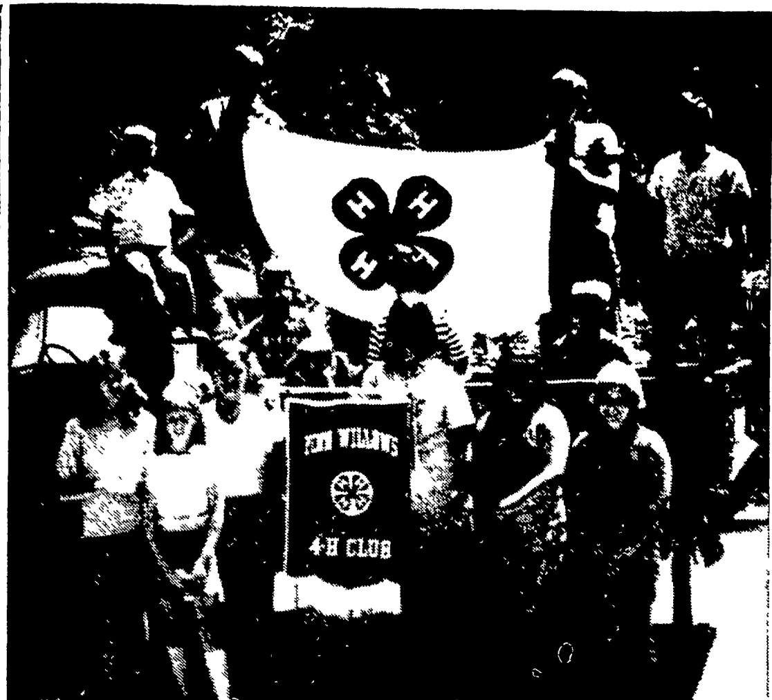
The Penn Willow 4-H Community Club held its roadside cleanup on June 20 in Poquea and Conestoga Townships from 9 a.m. till noon. A truck was loaned by each