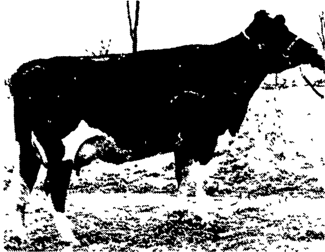
CHA-LIZ P. V. CINDERS, VG 89