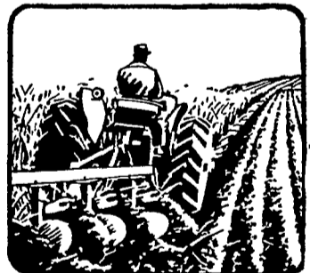
Enrich your land with Sudax Brand for plow-down. Large growth plow down easily.