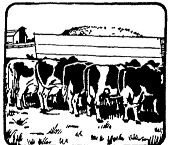
Sudax Brand green-chop is superior for tonnage, taste-appeal and feed value.