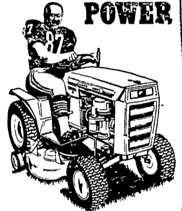
Green Bay Packer Willie Davis gets extra yardage with Wheel Horse Commando 8