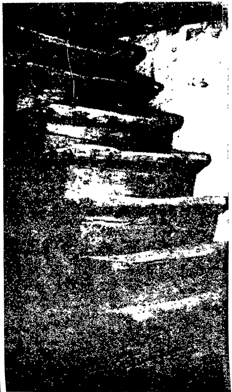
The hand-hewn steps in the Hans Herr house, one of many examples in the house of priceless construction in the early 1700's.