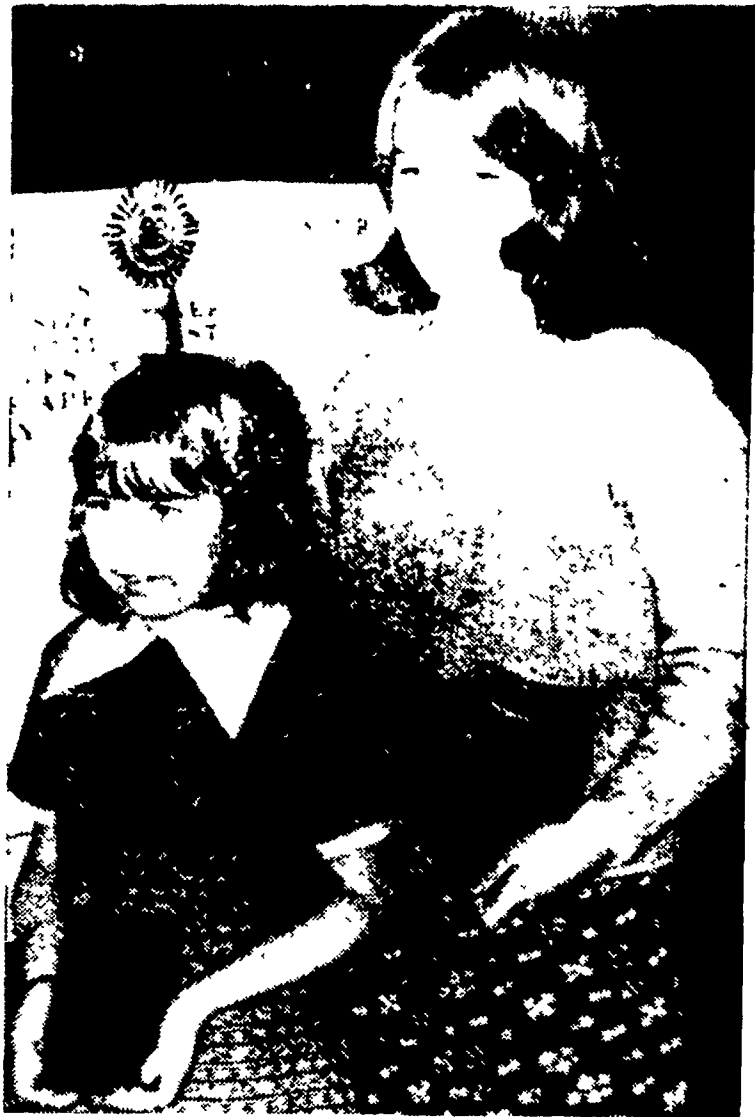
Two sisters this week captured top honors in the 4-H Soil and Water Conservation Club competition.

The Federal Meat Inspection Act administered by C&MS, requires Federal inspection of all meat products shipped across State lines or in foreign trade. It helps assure consumers that meat products moving in interstate or foreign commerce are wholesome, prepared and handled in a sanitary manner, and truthfully labeled.