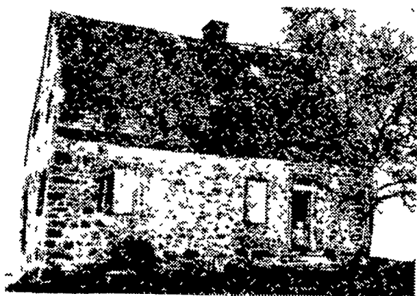
A Lithographed Full Color Reproduction of

NEW HOLLAND CONCRETE PRODUCTS, INC. NEW HOLLAND PENNSYLVANIA