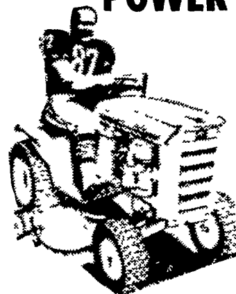
Green Bay Packer Willie Davis gets "extra yardage" with Wheel Horse Commando 8