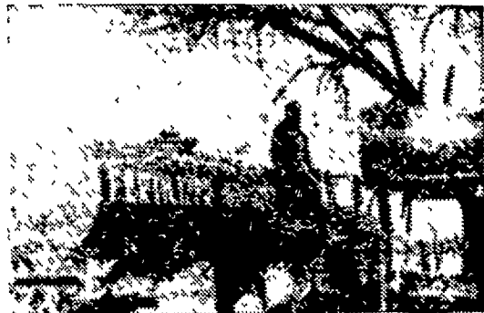
On-the-Farm Delivery by Growers Trucks