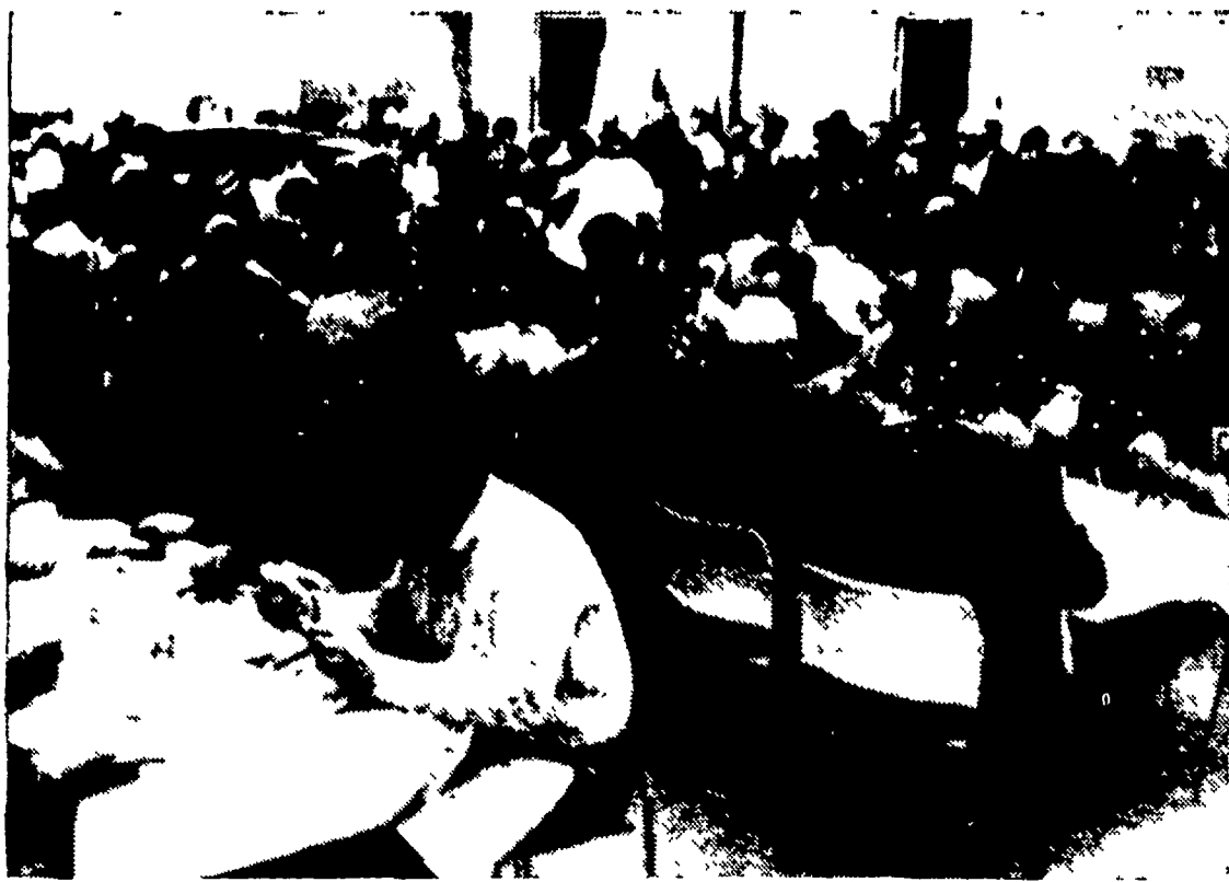
DINNER CROWD at the Agway Dairyman's Day.