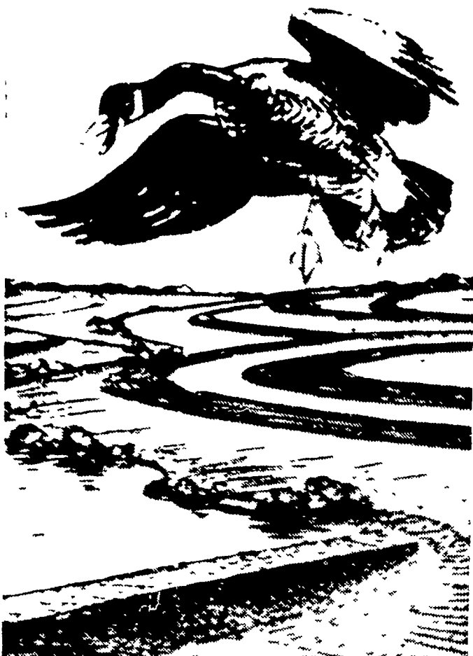
Take A Gander At Conservation